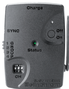
Universal Speed & Universal