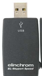
USB RX Speed & USB RX