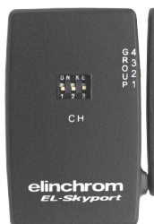
Transceiver RX 19353