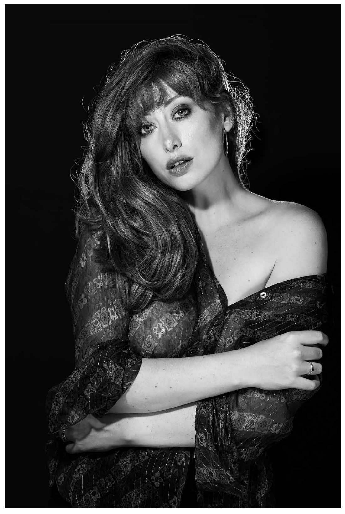
Canon EOS R3 + Canon RF 85mm f/1.2L USM (1/125 sec, f/6.3, ISO100)

The flash also exceeds its specs in terms of battery performance. We got almost 1,000 shots before needing to plug in a USB power source, and again – you can keep shooting with the One while using one of the best power banks (Elinchrom sells its own 20,000mAh bank that adds an additional 1,100 full power discharges).