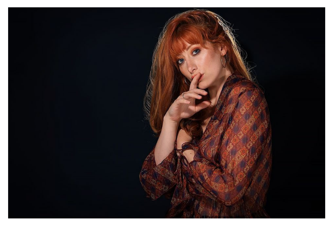
Canon EOS R3 + Canon RF 85mm f/1.2L USM (1/125 sec, f/6.3, ISO100)

It has a beautiful and intuitive touch menu system, enabling you to quickly and easily adjust everything from color temperature to modeling light power to even the color of the illuminated Elinchrom logo on the side – which not only lights up to indicate charge levels, but can also be used to differentiate multiple heads on a shoot (so one can be green, one can be red and so on for ease of reference).