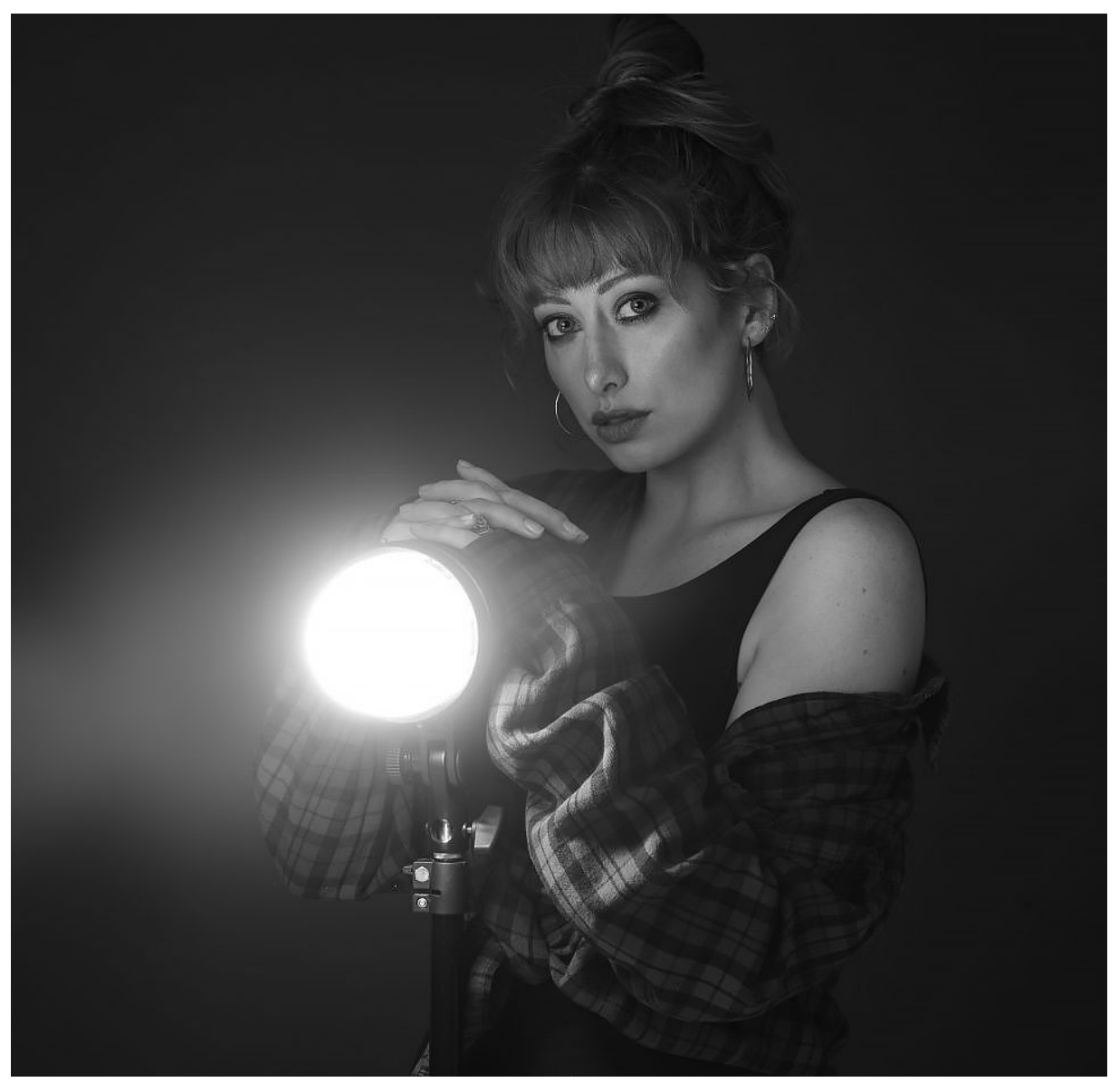
<u>Canon EOS R3</u> + <u>Canon RF 85mm f/1.2L USM</u> (1/125 sec, f/5.6, ISO100)